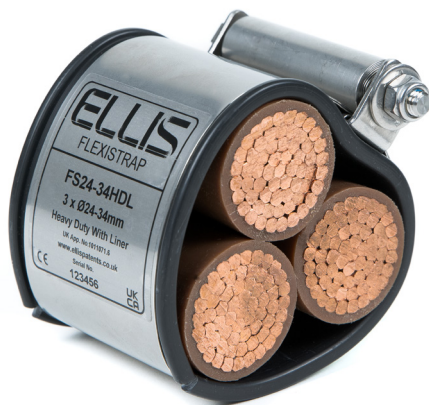
STANDARD DUTY SUITABLE FOR USE WITH VULCAN+ CLEATS