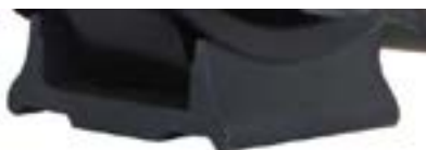
POLYMER BASE (WITH POLYESTER COATED FRAME)